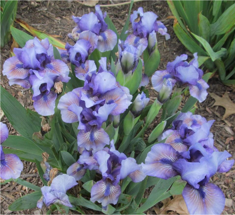
Muppet's Sister, SDB, D. Spoon 2015 (2 year clump)