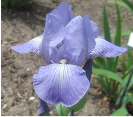
'At Last My Blue'