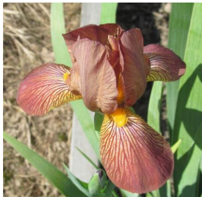
BD10UK, Rumbaugh MTB