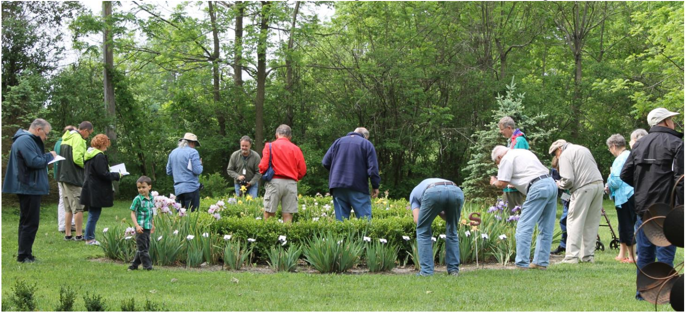
The Cordes boys (tomorrow's hybridizers?) checking out an attractive iris.

An 'S'-shaped bed housed the guest iris in one of the few sunny locations at the Stephens' Garden near rural Pittsboro, IN. The large lot was home to many different plants and attractions including a waterfall.