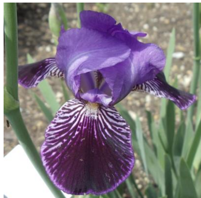
Velvet Intrigue, Wendell MTB