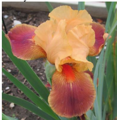
S-03-13-1, IB Sorenson