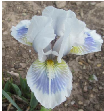
S-02-5-17, Sorenson SDB