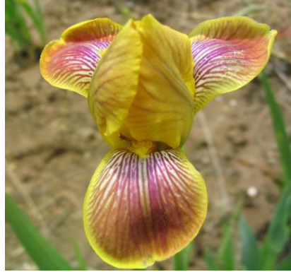
'Breakfast in Bed'

The popularity poll was divided by iris type, including Best Seedling. 'At Last My Blue' and Paul Black's AB 'Heart of Hearts' were the only two to get more than half the votes cast.