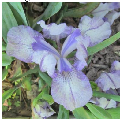
13-1, MTB Wolfe