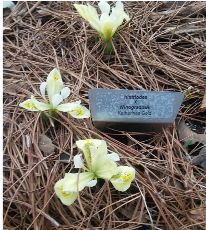
SPX Katharine Hodgkin(Histriodes X Winogradowii) SPX Katharine's Gold,(Histriodes X Winogradowii)