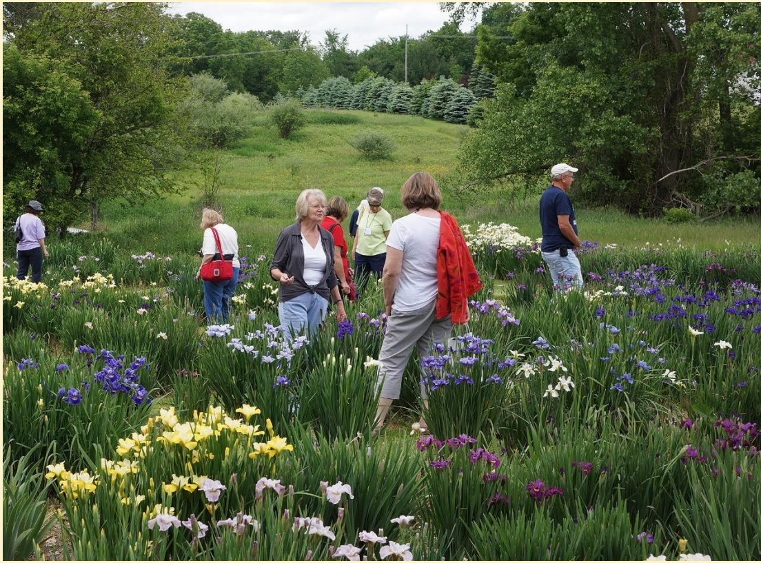
Join other region iris lovers at the 2023 Spring Meeting (Photo: Hollingworth garden)