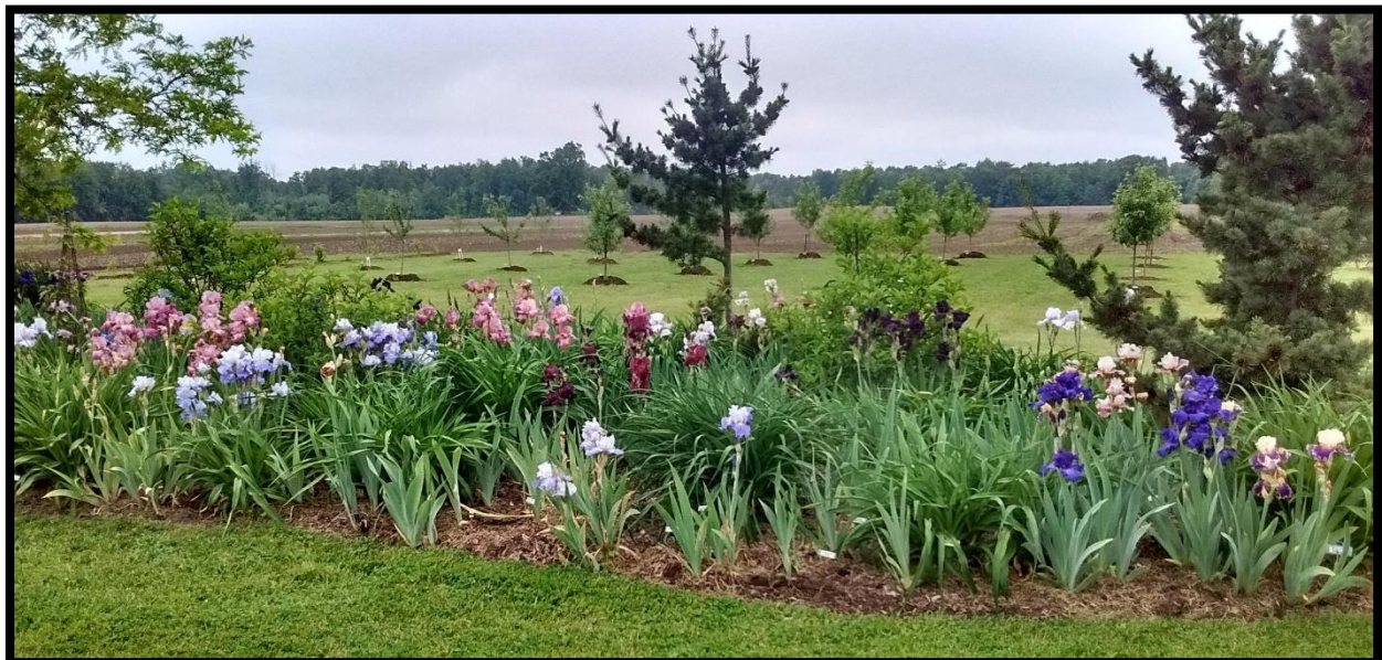
The Hamlick Garden will be on the spring 2023 garden tour.