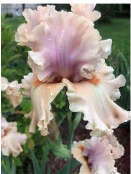
Cordes Seedling may be blooming for our 2023 spring regional meeting