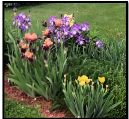
Hamlick Garden on the Spring Meeting Tour